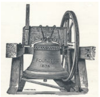
The Lancashire Association of Change Ringers